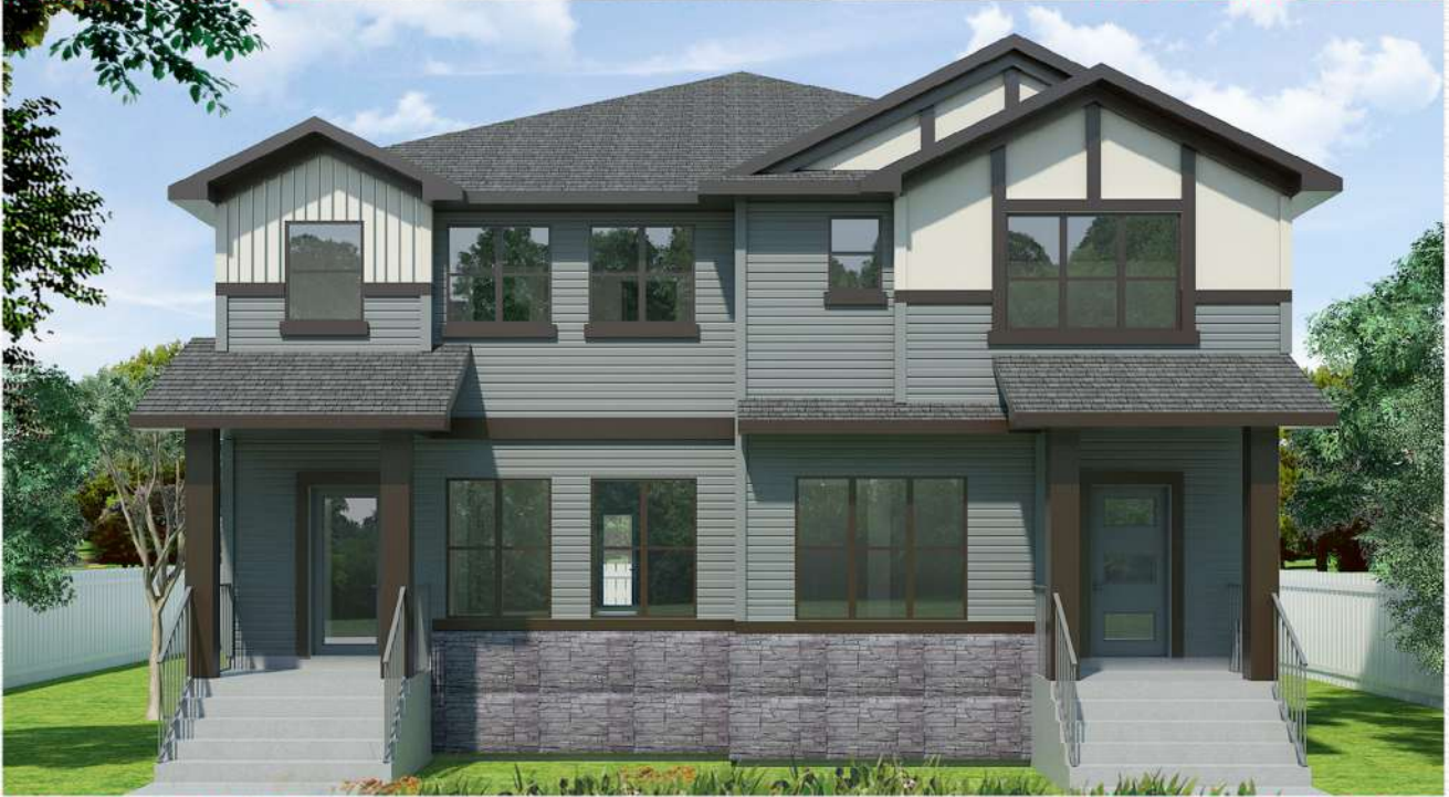
UNIT A :1600 SQ.FT.