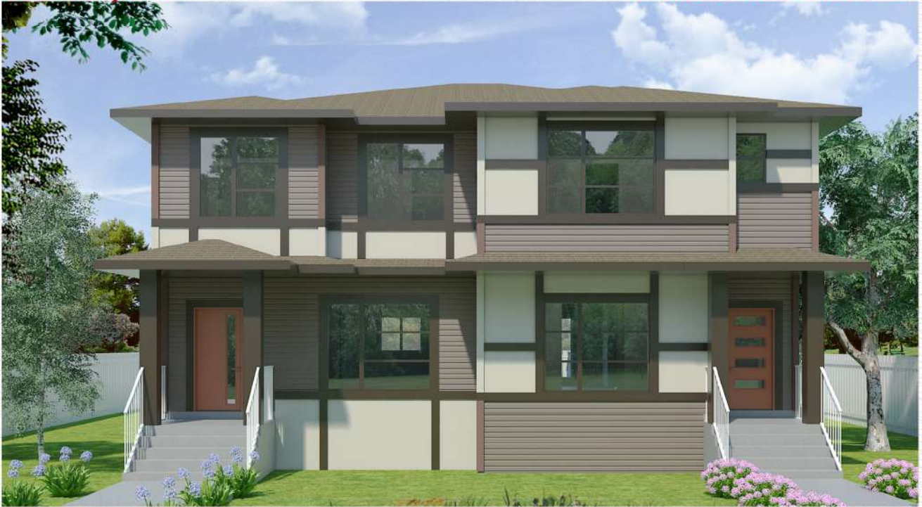
UNIT A :1425 SQ.FT.